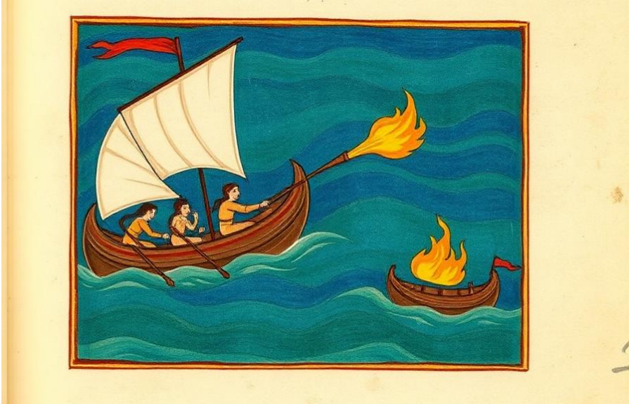
Position before exchange. Then ram, board, burn, or break off.

A ship is a Battle Group with a ship track instead of an Order track — Strained (−1 to hull-dependent rolls) → Holed (no full speed, taking water) → Foundering (roughly an hour to beach, transfer the crew, or strike colours). Class sets the slots before Foundering: Dromon 3, Chelandion 4 (Strained one step easier), Pamphylos 2, merchantman under sail 3 (only Holed actually threatens her).