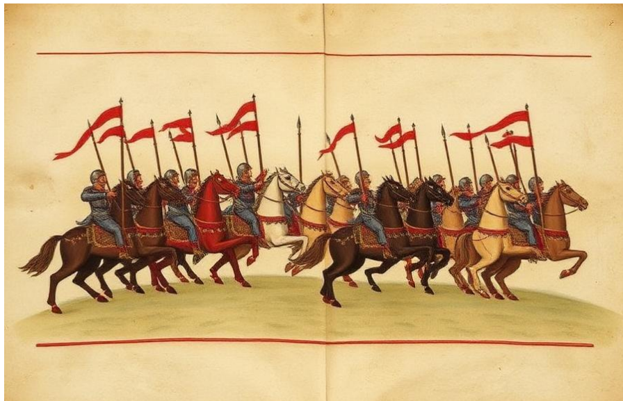
Kataphraktai, lances couched — one charge, then default.

Any Battle Group built as cavalry carries a horse track alongside its Order track — Winded (–1 to rolls depending on the horse), Lamed (cannot be galloped), Foundered (out of the fight, on foot). A mounted group takes horse-track hits from forced marches and from missile fire that misses the Order roll narrowly (GM's call).